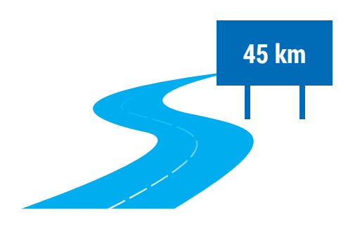
Cobequid Pass – 45 km of highway was twinned in less than 2 years through Province/Federal cost-sharing and paid back through tolls. All maintenance, including repairs and winter clearing, is also covered by the revenue from tolls.