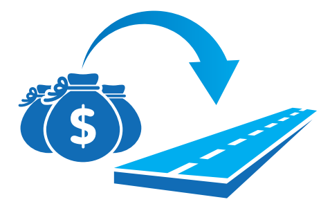
Over the past 2 years, the province has invested over $455 million dollars in highway infrastructure.

Twinning the eight sections included in this study would cost more than $2 billion. Given that cost, we're studying the feasibility of tolling as an option to allow twinning to take place sooner. We want to hear what Nova Scotians think about this.